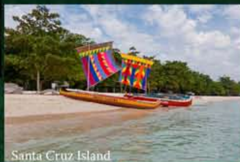
Santa Cruz Island