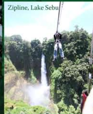
Zipline, Lake Sebu