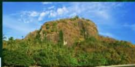
Dakak Beach Resort