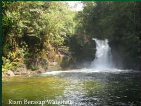
Riam Berasap Waterfalls