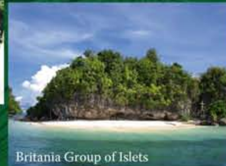
Britania Group of Islets