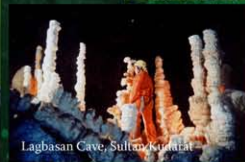
Lagbasan Cave, Sultan Kudarat